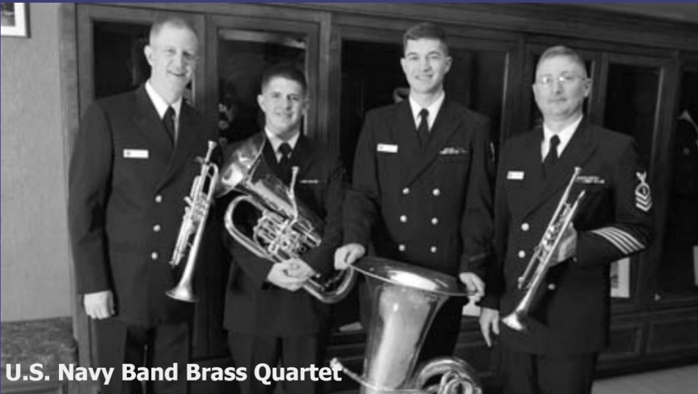
U.S. Navy Band Brass Quartet