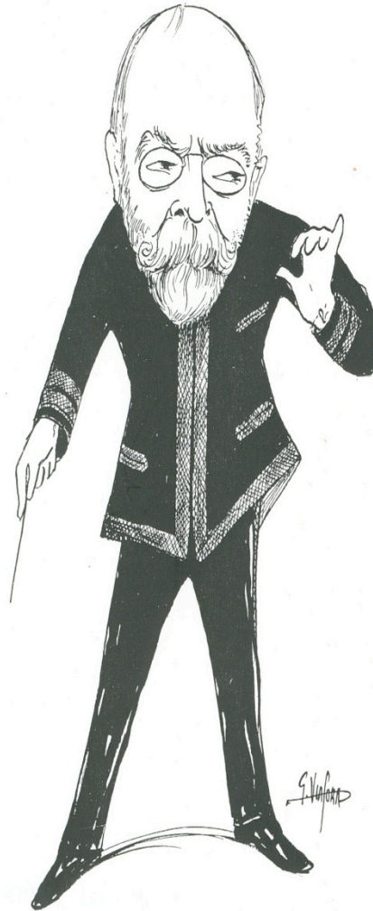
John Philip Sousa, Whose Melodious and Stirring Band Music Has Carried His Name as an American Composer All Over the World

MUSICAL AMERICA'S GALLERY OF CELEBRITIES—No. 26