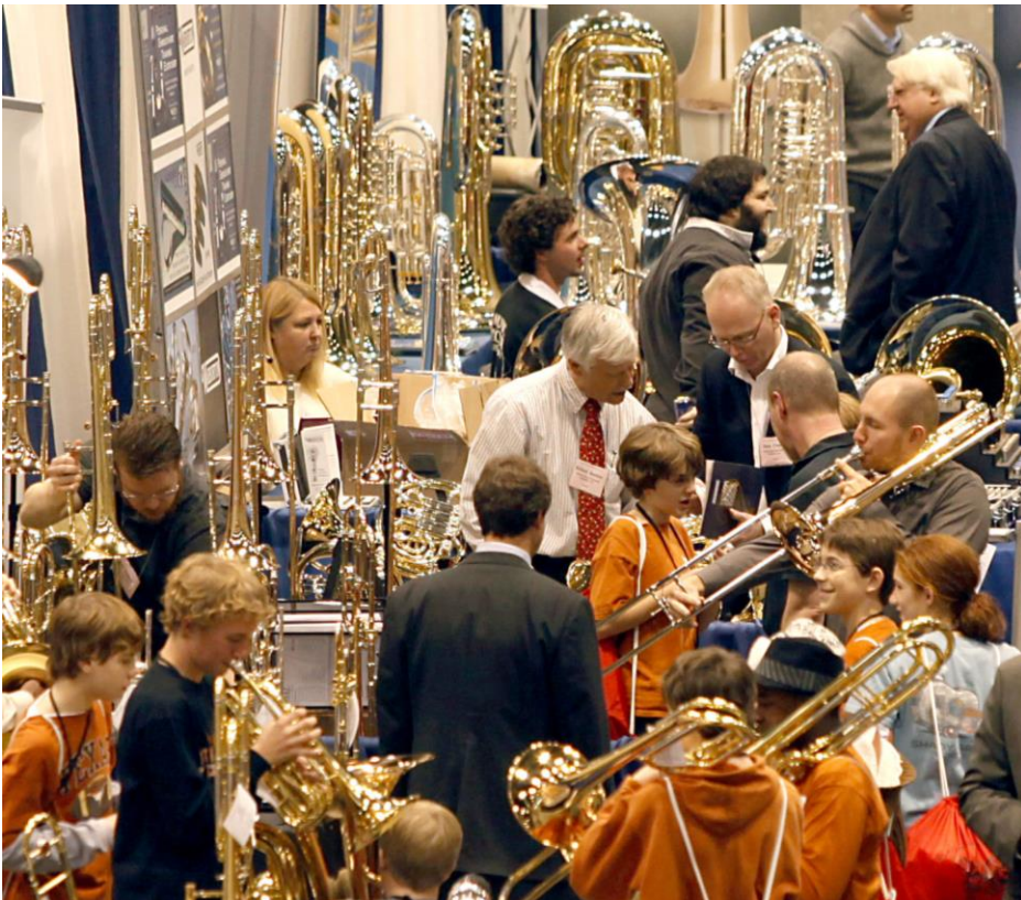
EXHIBIT HALL SCAVENGER HUNT FOR PRIZES!

This year's exhibit hall is turning out to be one of our largest with over 700 booths and EVERYTHING from the music industry! There will be an EXCLUSIVE HOUR to visit the exhibits on Wednesday, December 17, 9:30 – 10:30AM & Thursday, December 18, 12:30 – 1:30PM.