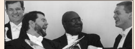
Sotto Voce Tuba Quartet

Gunther Schuller Sponsored by the Big Ten Band Directors Association