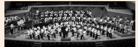
Saitama Sakae High School Wind Orchestra