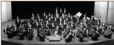
Winter Park High School Philharmonic Orchestra