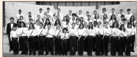
McCracken Middle School Symphonic Band