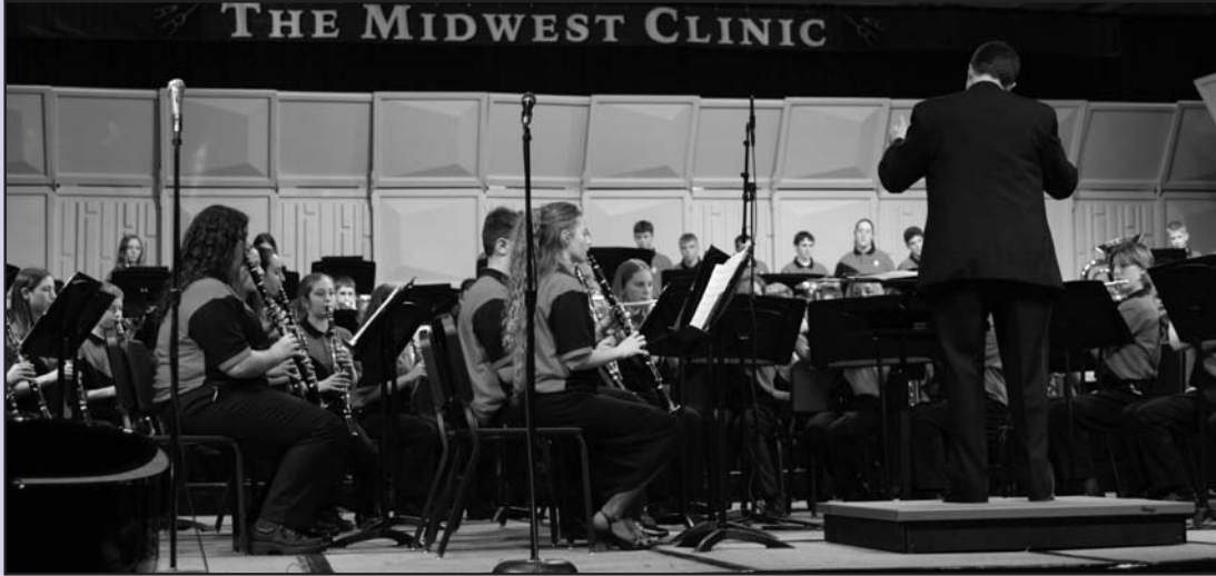
Edgewood Junior High School Band