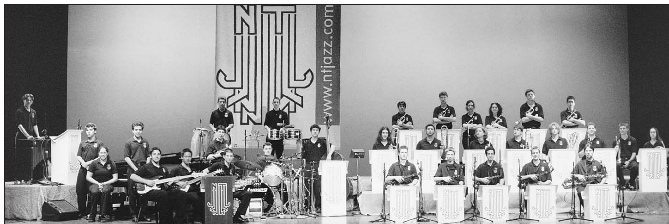
New Trier High School Jazz Ensemble I