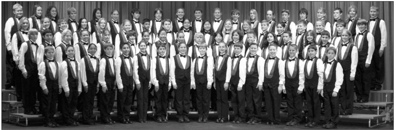
Bailey Middle School, Austin, Texas