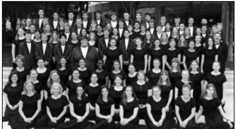
Ponca City High School Symphony Orchestra