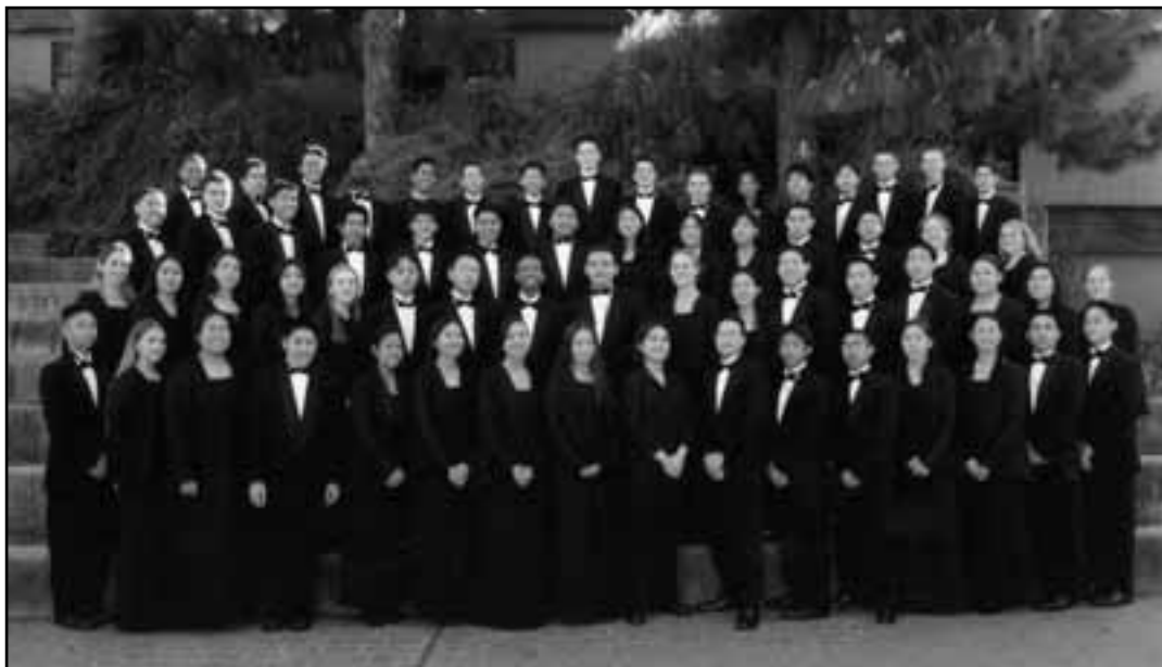
James Logan High School Wind Symphony