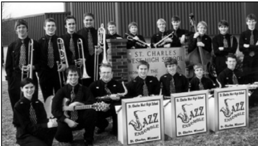
St. Charles West High School Jazz Ensemble

A void standing in registration lines when you arrive at the conference. Get reimbursed by your district before you attend. Pre-registration is currently available through the Midwest Clinic website. It only takes a few minutes. We encourage you to take advantage of this opportunity to register for the 57th Annual Midwest Clinic ahead of your arrival in Chicago.