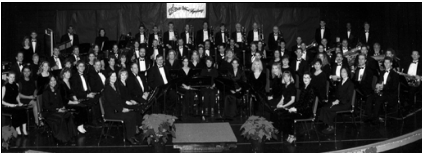
Cobb Wind Symphony