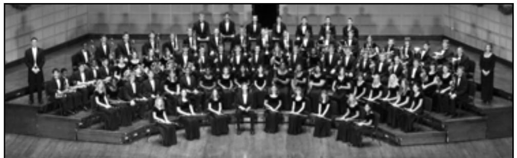
Coyle Middle School Honors Band