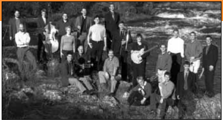
University of Wisconsin Eau-Claire Jazz Ensemble I