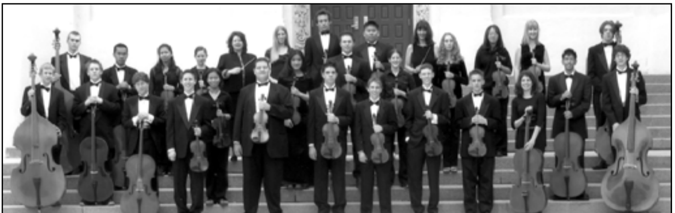
Las Vegas Academy Orchestra