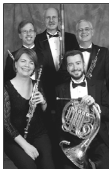
The Cumberland Quintet

Sponsored by Alfred Publishing Co., Inc.