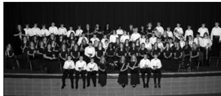
Rising Starr Middle School Symphonic Band