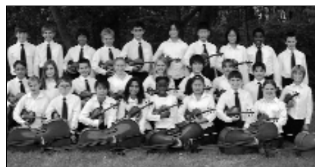
Bridle Path/Montgomery Elementary Select String Ensemble