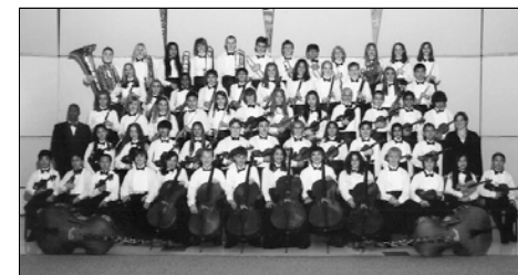
Cinco Ranch Junior High Symphony Orchestra