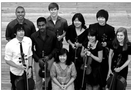
Walton High School Chamber Music Society