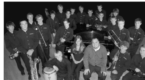
The Music School's Crescent Super Band