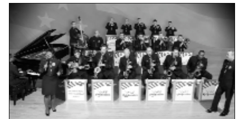
The United States Army Field Band Jazz Ambassadors