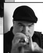
Randy Brecker Trumpet Soloist