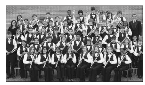
Krimmel Intermediate School Symphonic Band