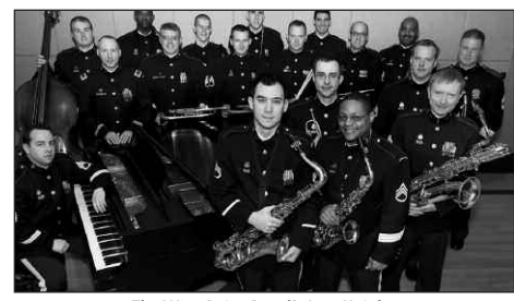
The West Point Band's Jazz Knights

It's Not Just Scales and Chords: Equipping Your Beginning Improvisers with Tools of Expression Matt Pivec