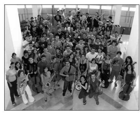
Murcia Youth Symphony Orchestra