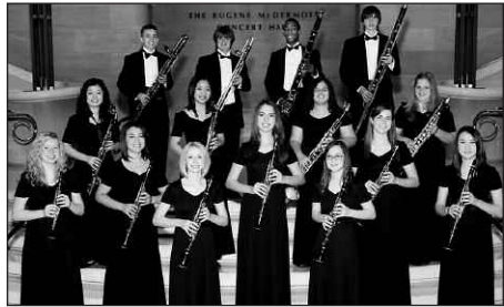
Hebron High School Clarinet Choir